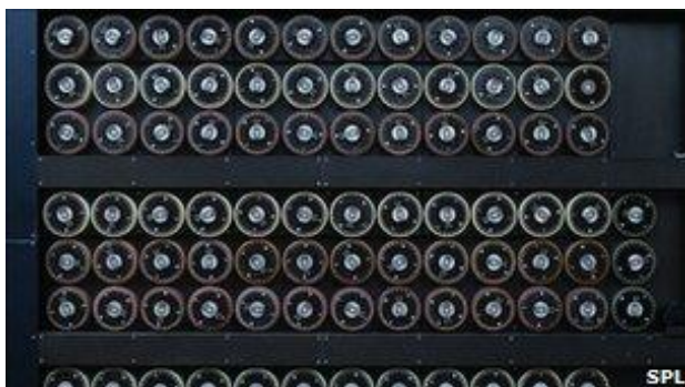
Turing's Bombe machine is viewed by many as the progenitor of the modern computer

Please keep on giving, and if you have any suggestions as to how to get Microsoft, Apple, Yahoo!, Facebook, and other high-tech firms to match or better the incredibly generous donation of $100,000 made directly to Bletchley Park by Google in support of this campaign please let me know!